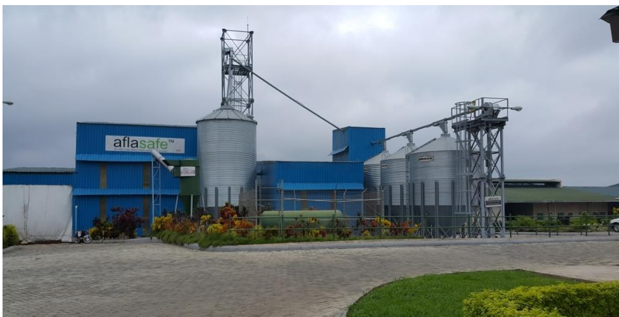
Figure: The manufacturing plant of Aflasafe, a biocontrol product for aflatoxin mitigation, located at the IITA campus in Ibadan, Nigeria.

Smallholder farmers harvest, store and consume home-grown crops. The deployment of Aflasafe can profoundly improve safety of food of smallholder farm families and reduce postharvest losses since the technology dramatically reduces the source of contamination in the field before harvest, during storage and until maize/groundnut is consumed. Reduced crop contamination could translate into improved food security and better access to domestic, regional and international markets that pay premium for aflatoxin standard abiding maize and groundnuts. Scaling-up of biocontrol has also the potential to revitalize exports and to increase smallholder farmers' opportunities to access premium export markets where aflatoxin-safe grain is a prerequisite for trade. For realizing health and income improvements, the biocontrol technology must be scaled up to reach the various players in the maize and groundnut value chains by developing sustainable product manufacturing and delivery mechanisms. Several challenges remain for scaling up. To address these challenges, the next phase of Aflasafe development is geared towards technology transfer to the private or public sector (as per situational analysis) and commercialization of the product in 11 countries.